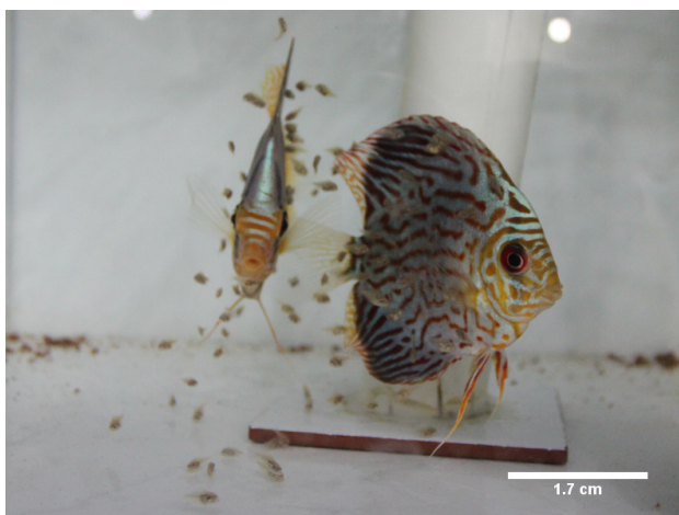
Figure 2. The caring behavior is extended after hatching. This figure is in color in the electronic version.

As the larvae developed, they began swimming in an errant way, falling off the substrate. The parents were observed collecting the larvae in their mouths and returning them to the substrate. At this stage, the parents had darker shades in their color patterns, which attracted the offspring to their parents because the discus larvae at the beginning of oriented swimming exhibit negative phototaxis, in other words, they are attracted to darker objects.